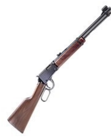
Henry 22 Classic Lever Action Rimfire Rifle