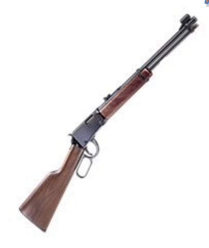
Henry 22 Classic Lever Action Rimfire Rifle